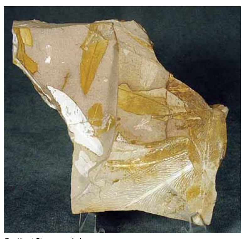
Fossilized Glossopteris leaves

What is the evidence that the continents have moved?